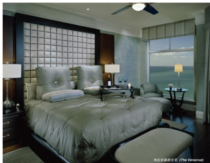
韦拉克鲁斯住宅 (The Veracruz)