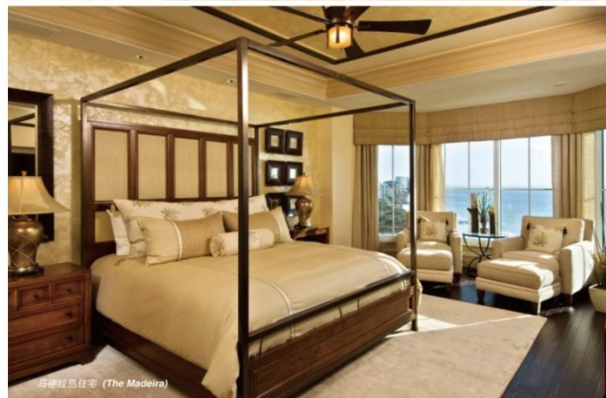
马德拉岛住宅 (The Madeira)

LING: Design and art are always inseparable. You own a gallery as well. What are the artists you have most interactions? Do they bring you any design ideological inspiration?