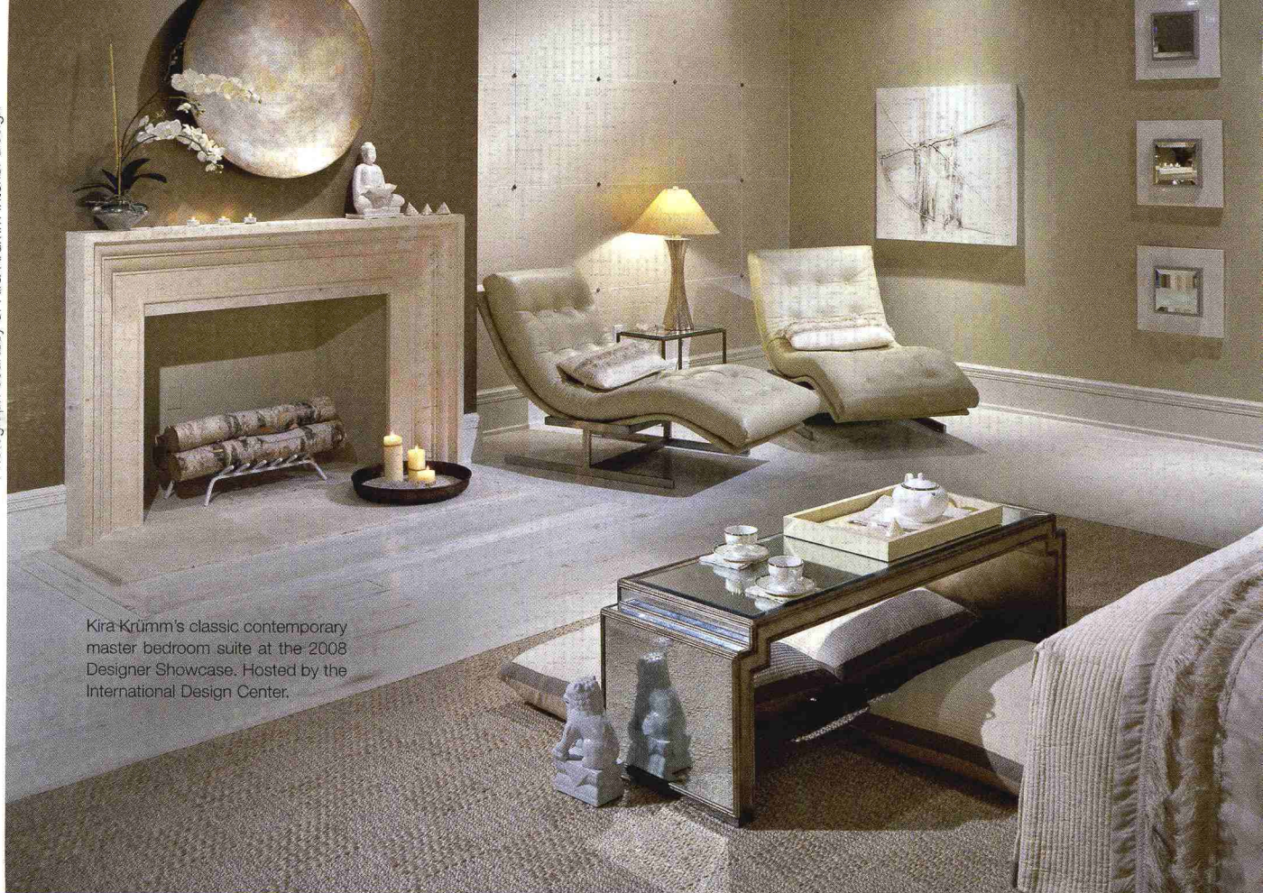
Kira Krümm's classic contemporary master bedroom suite at the 2008 Designer Showcase. Hosted by the International Design Center.