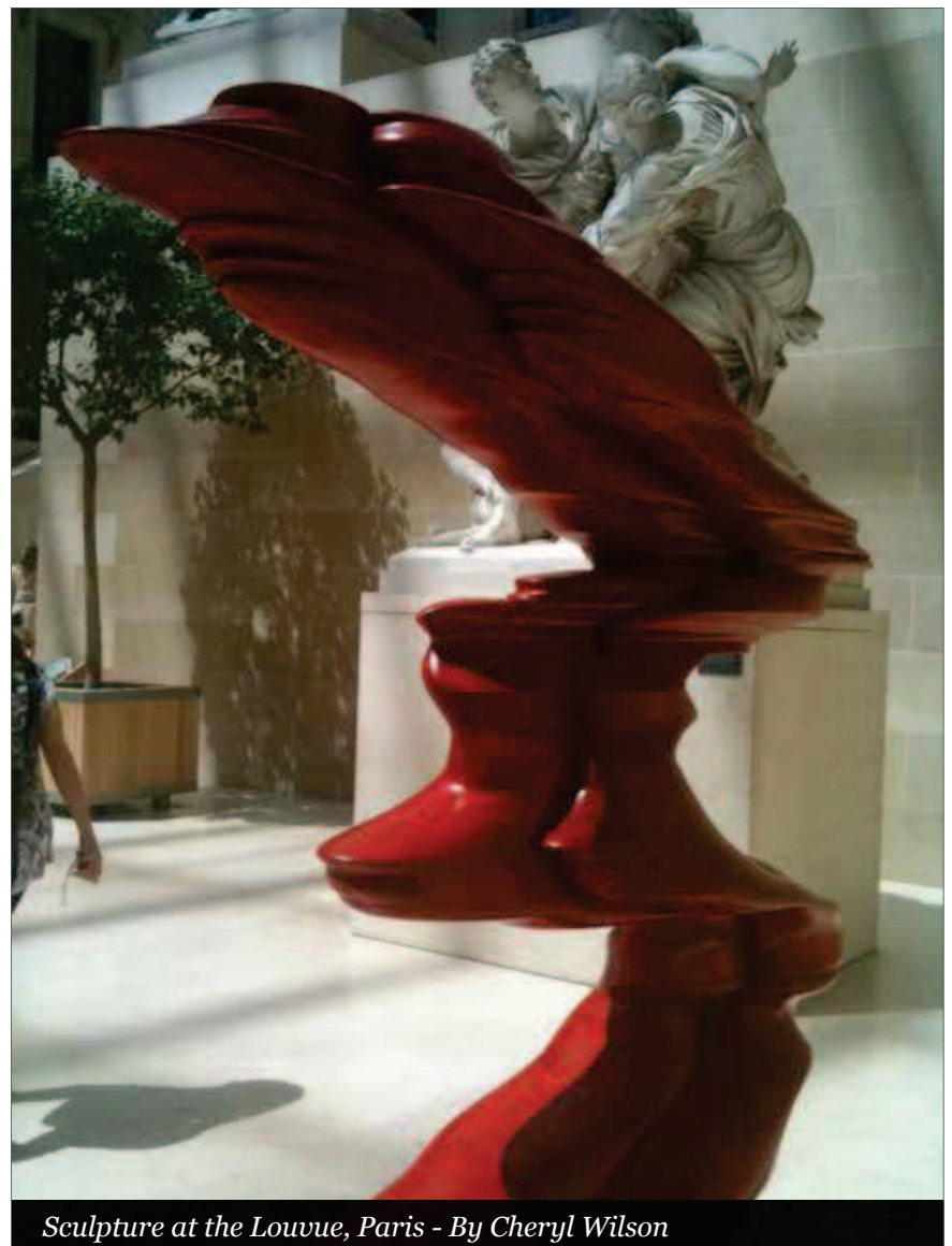
Sculpture at the Louvree, Paris

I love talking to people about my favorite destinations and future adventures and hear their stories. Sometimes you find people that share your passion for certain places and sometimes you learn about places that you