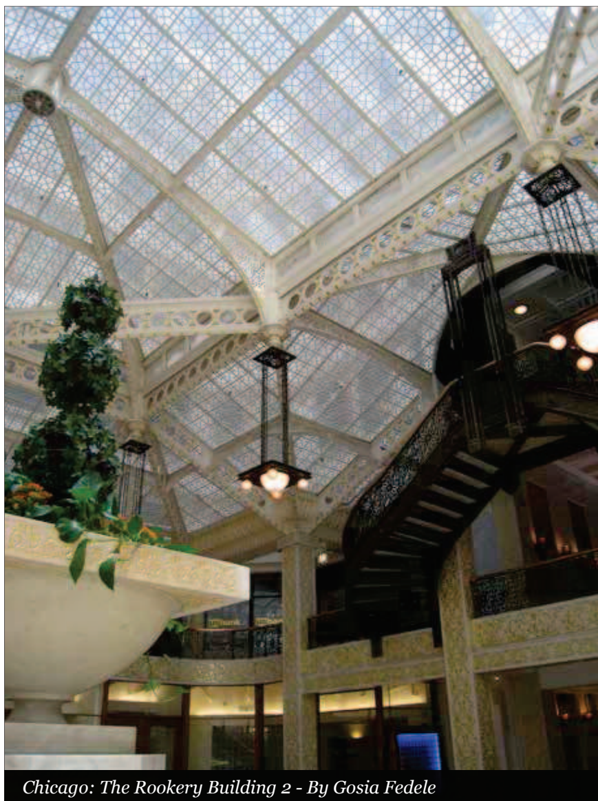
Chicago: The Rookery Building 2 - By Gosia Fedele

Russia, as I have always been curious of their way of living, their architecture, their people. It is on my bucket list.