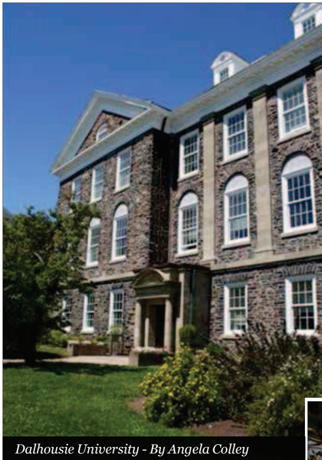
Dalhousie University - By Angela Colley

tradition and modernity, and their breathtaking blend of architectural and design styles. They are a source of endless inspiration, always ready to be discovered over and over again.