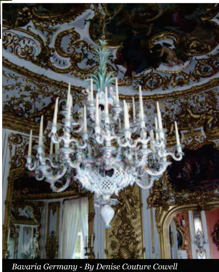
Bavaria Germany

I have incorporated colors, furnishings, accents, and new ideas for creating a feeling and sense of place.