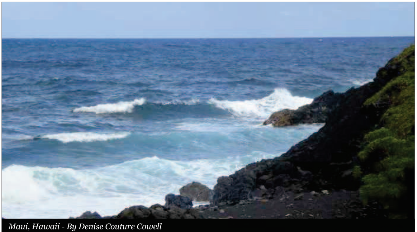
Maui, Hawaii

While there are many places I've already seen, every subsequent trip to that same region offers new finds. It's always on the second and third trip that I experience things differently, maybe because I become less of a tourist and more of a "local." The one place, I think, that is greatly underestimated by designers, is the amazing microscopic world surrounding us. Luckily, we don't have to go far to see it, we just need to stop running and start looking around.