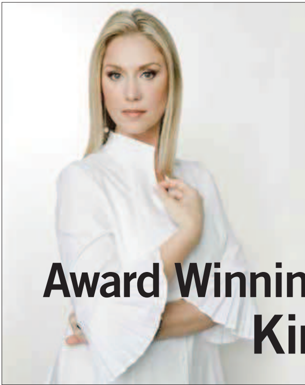
Kira Krümm - By Kira Krümm International Design