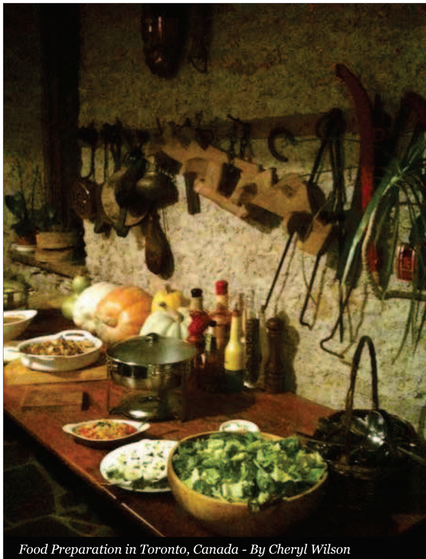
Food Preparation in Toronto, Canada

There is a special synergy that I have found in China, which has had a profound influence on my creative perspective. I find that my design