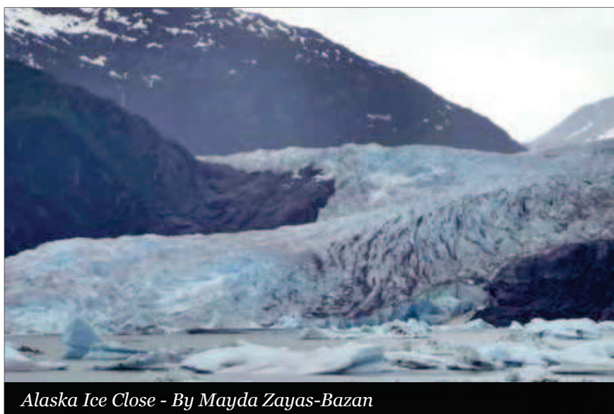
Alaska Ice Close

Gaining inspiration from our travels, be it for business or pleasure, seems like a pastime for much of the design trade. Many seem born to explore and have an excellent ability to analyze their surroundings. The sheer thrill of seeing and experiencing locations etches fond memories that can be summoned at a moment's notice. Professional Design Magazine interviewed several ASIDFSC members to hear about their most memorable travel experiences and to learn how these journeys have inspired them.