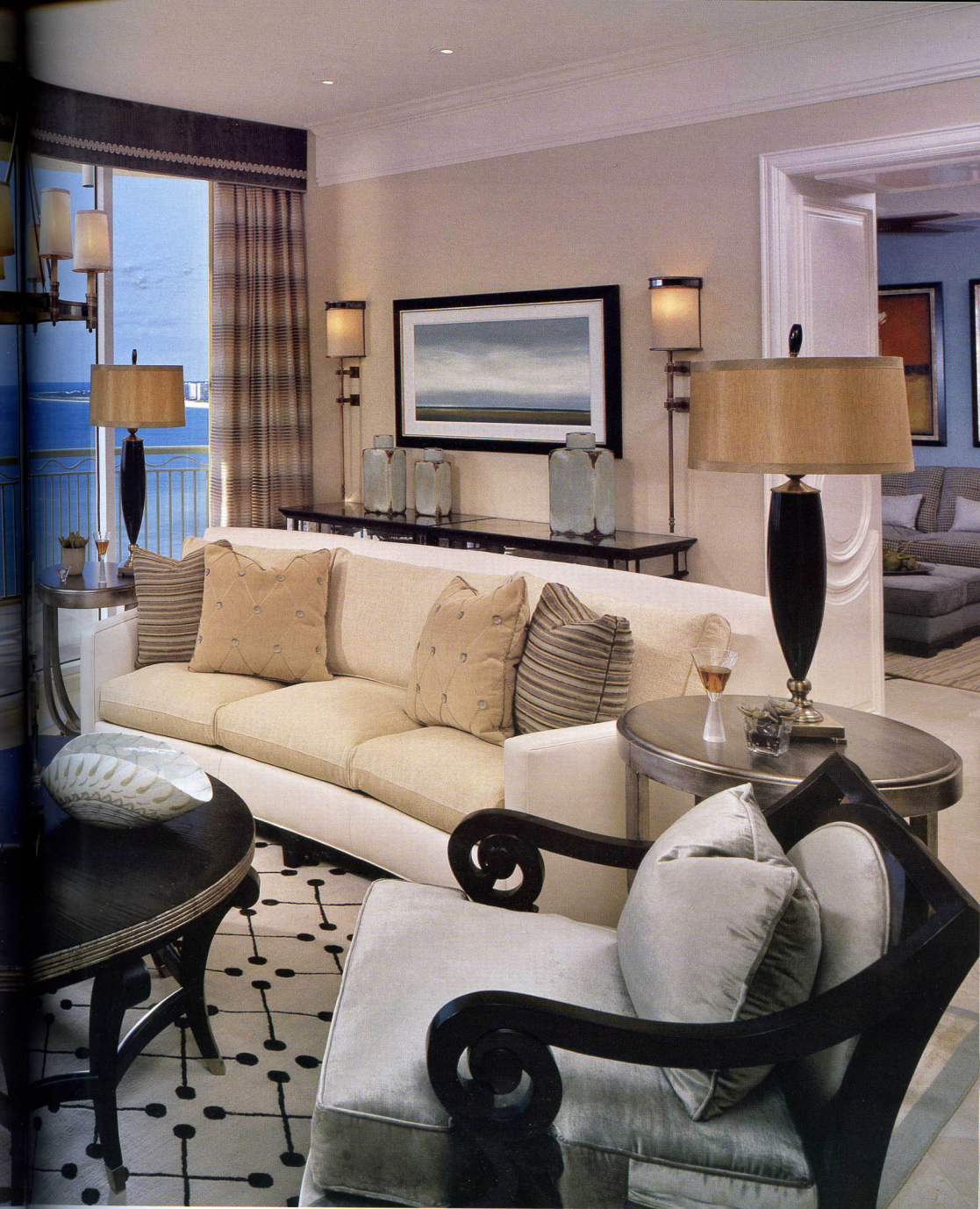
ABOVE: The grand salon epitomizes the merging of two different styles, traditional and contemporary, that come together in perfect harmony with a soft palette of aqua, creamy vanilla, platinum and ebony.