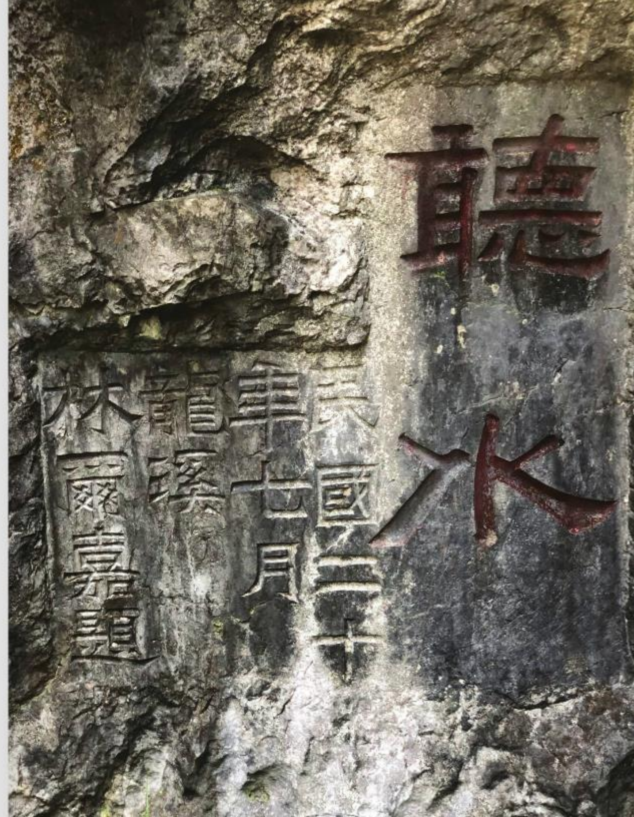
Top: Elephant Trunk Mountain, Guilin, China. Bottom: Stone Buddha carving, Lingyin Temple, Hangzhou, China. Opposite page: Ancient Chinese characters carved into mountainside