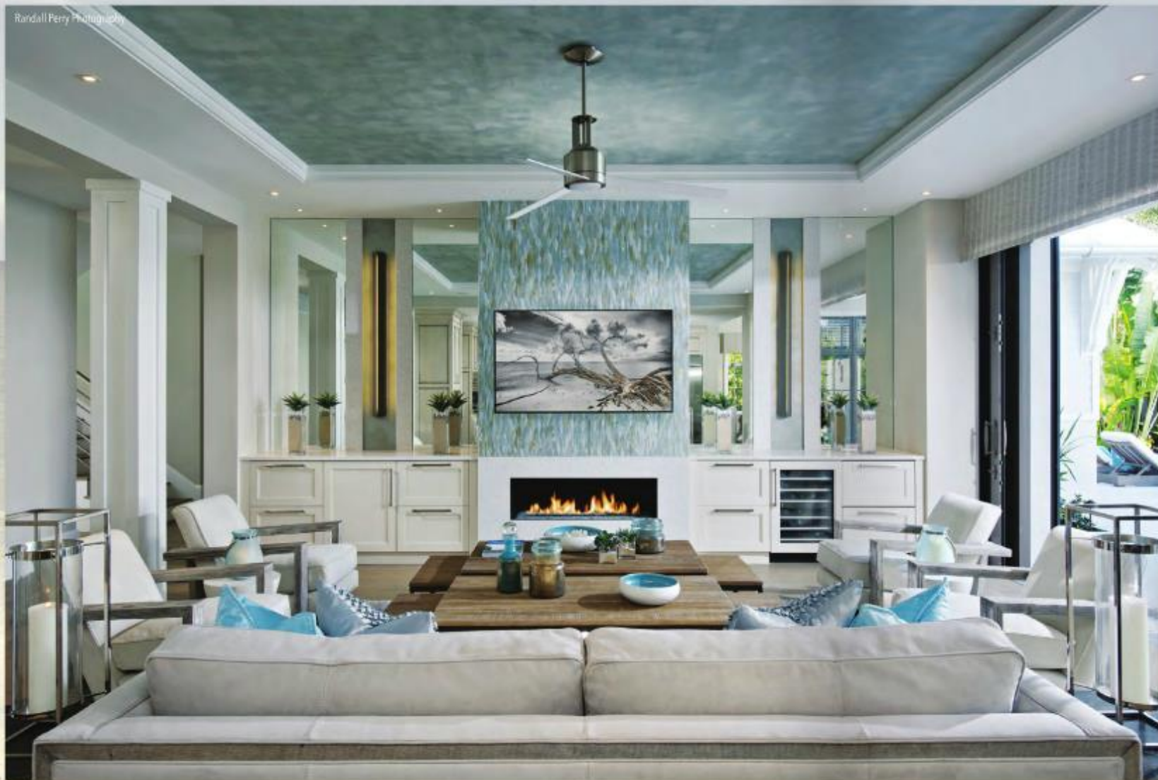
Above: Old Naples beach house living room designed by Koastal Design Group - Kira Krümm & Co. Opposite page: Designer Kira Krümm on the beach in Naples.