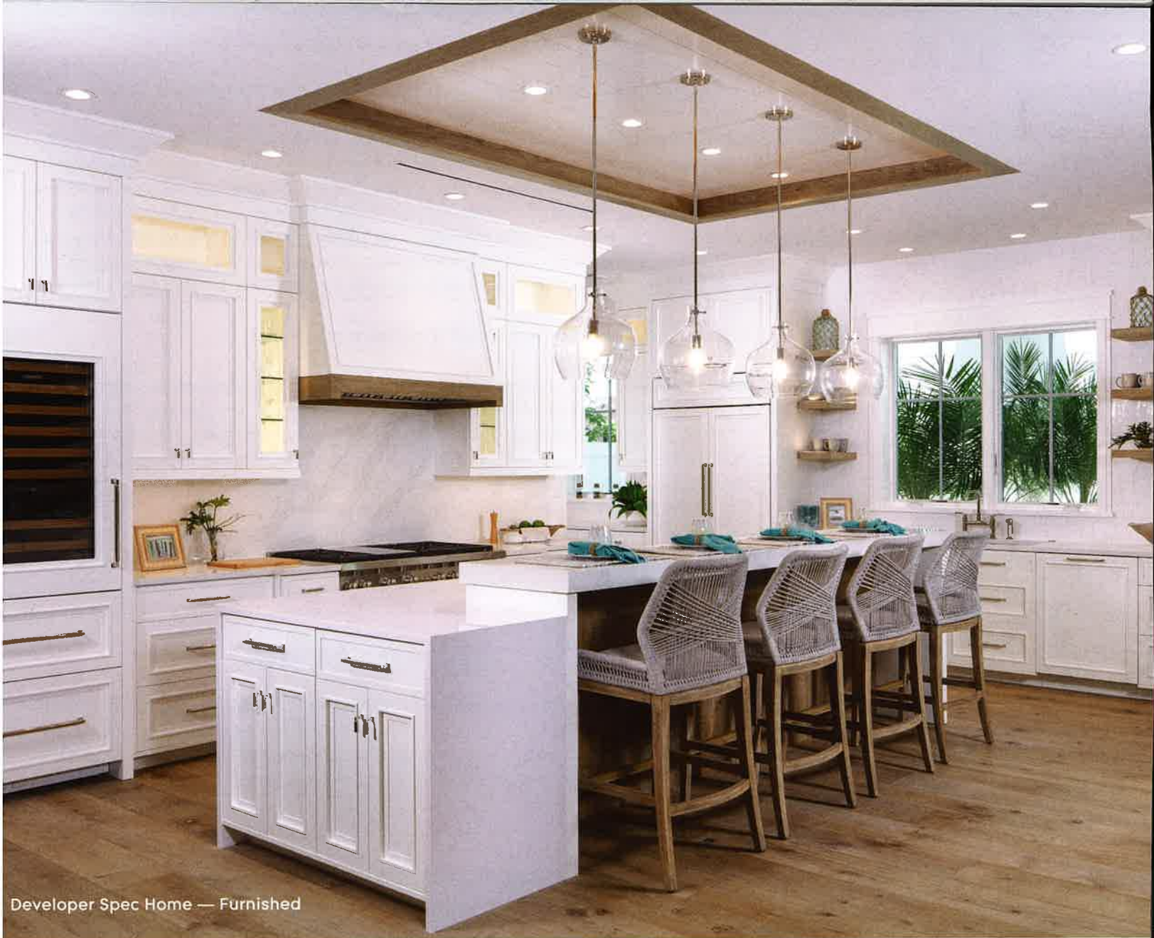
Developer Spec Home — Furnished