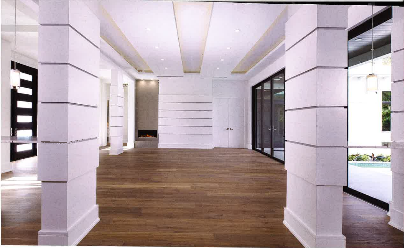
Private Investor Spec Home